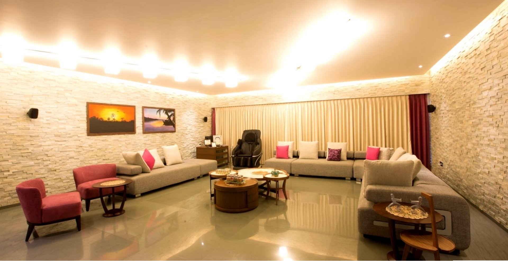
02. LIVING AREA