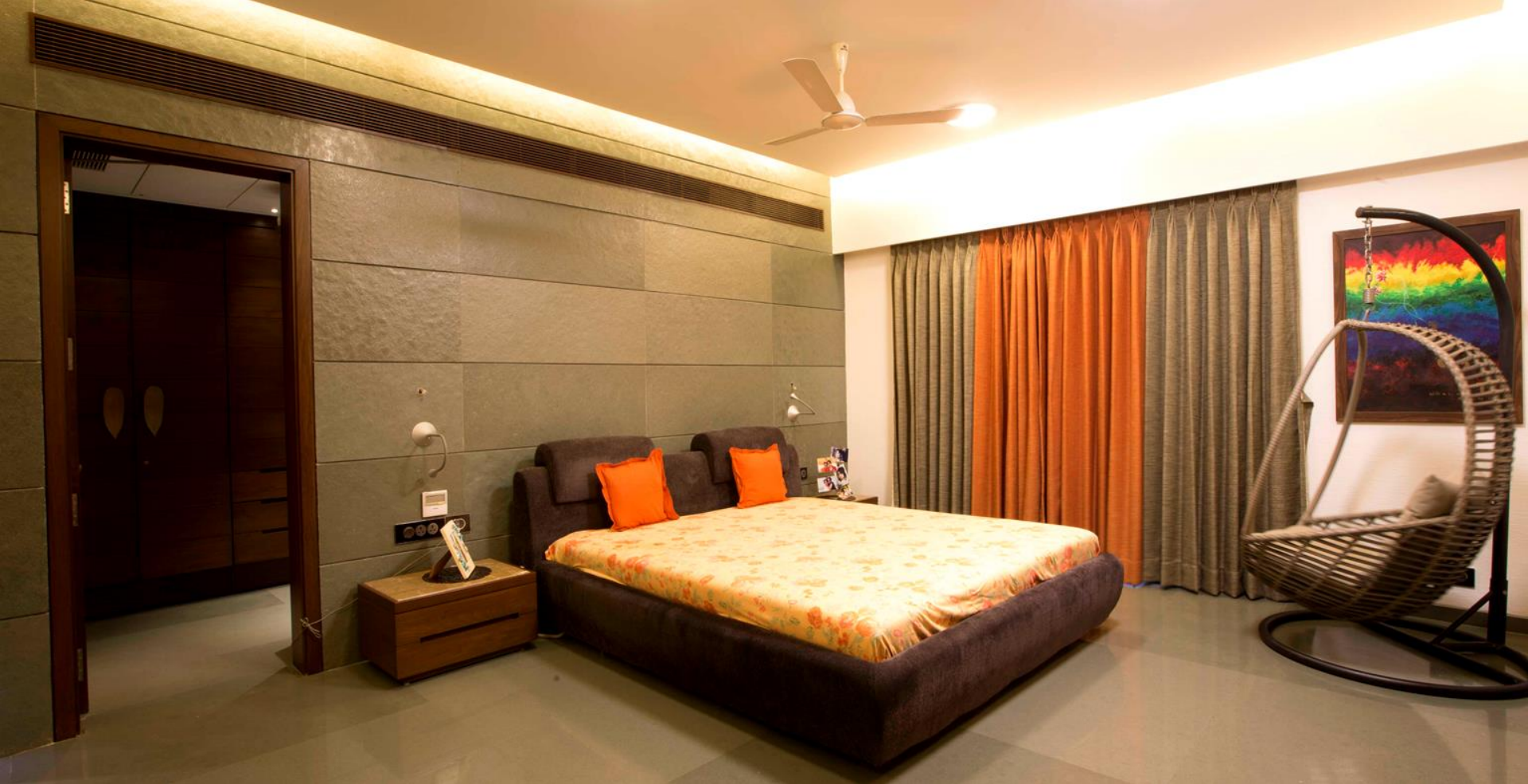
07. MASTER BEDROOM