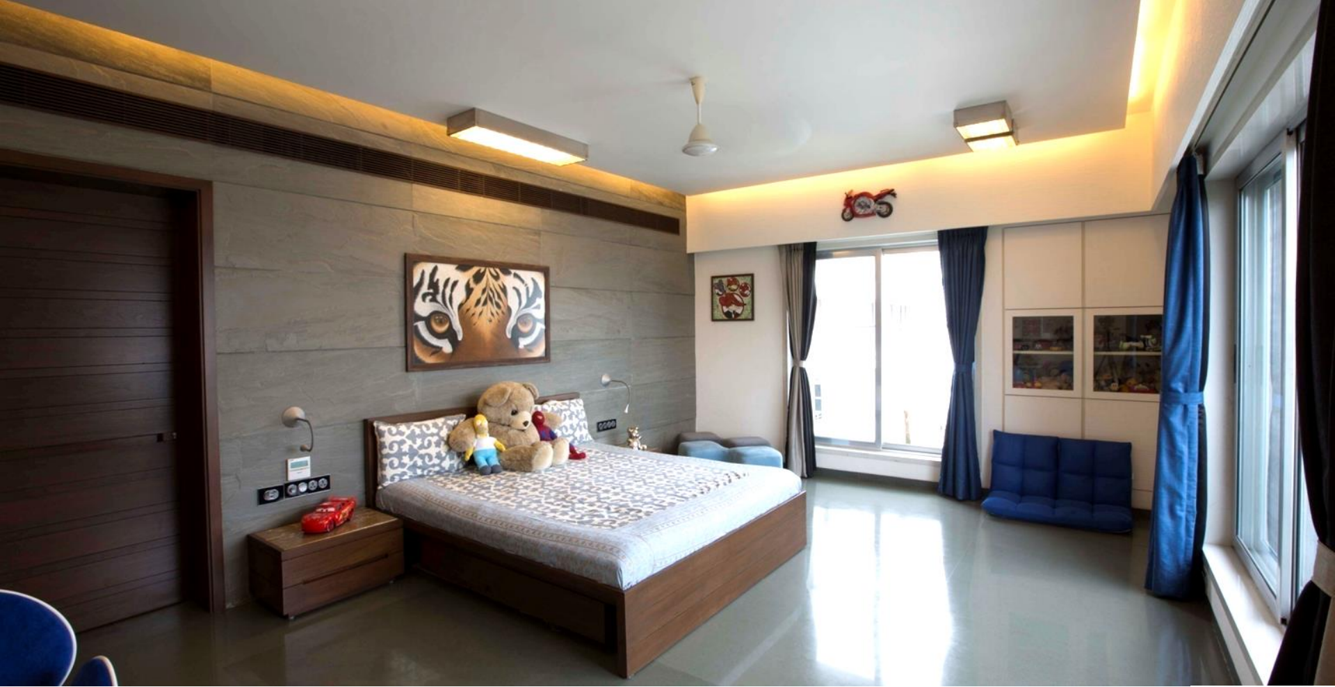
10. SON'S BEDROOM