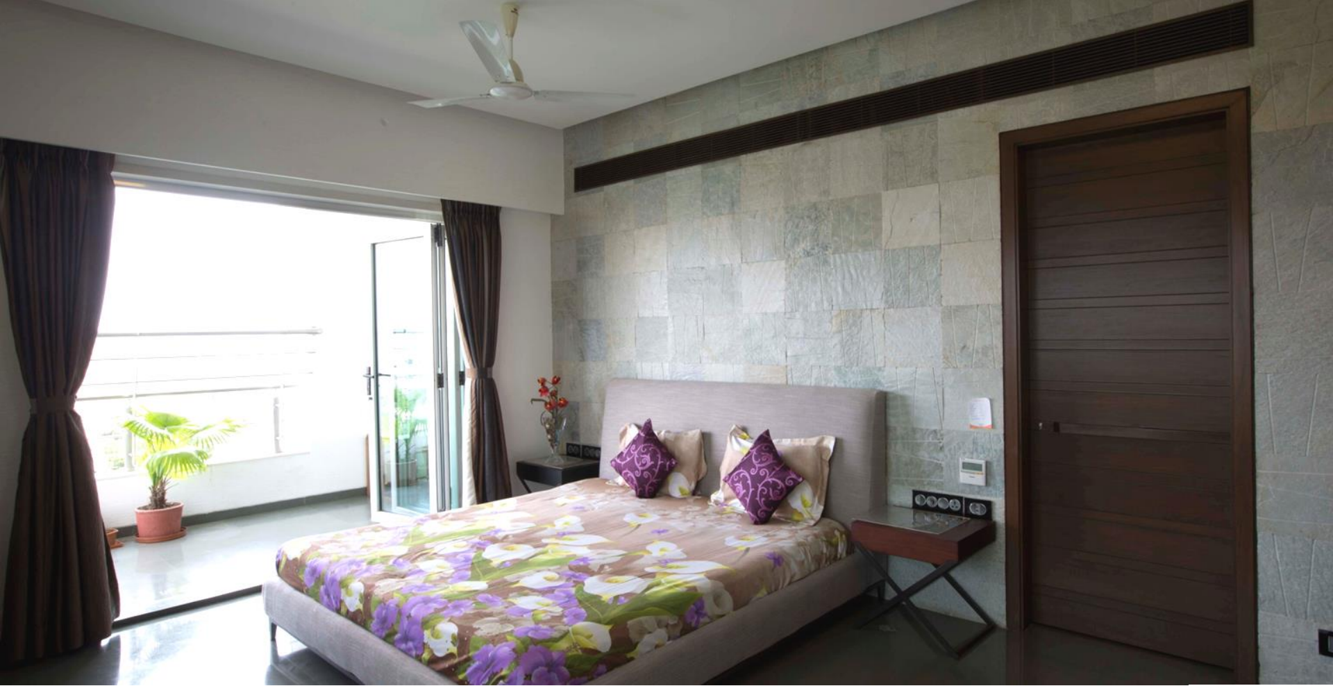
08. PARENTS BEDROOM