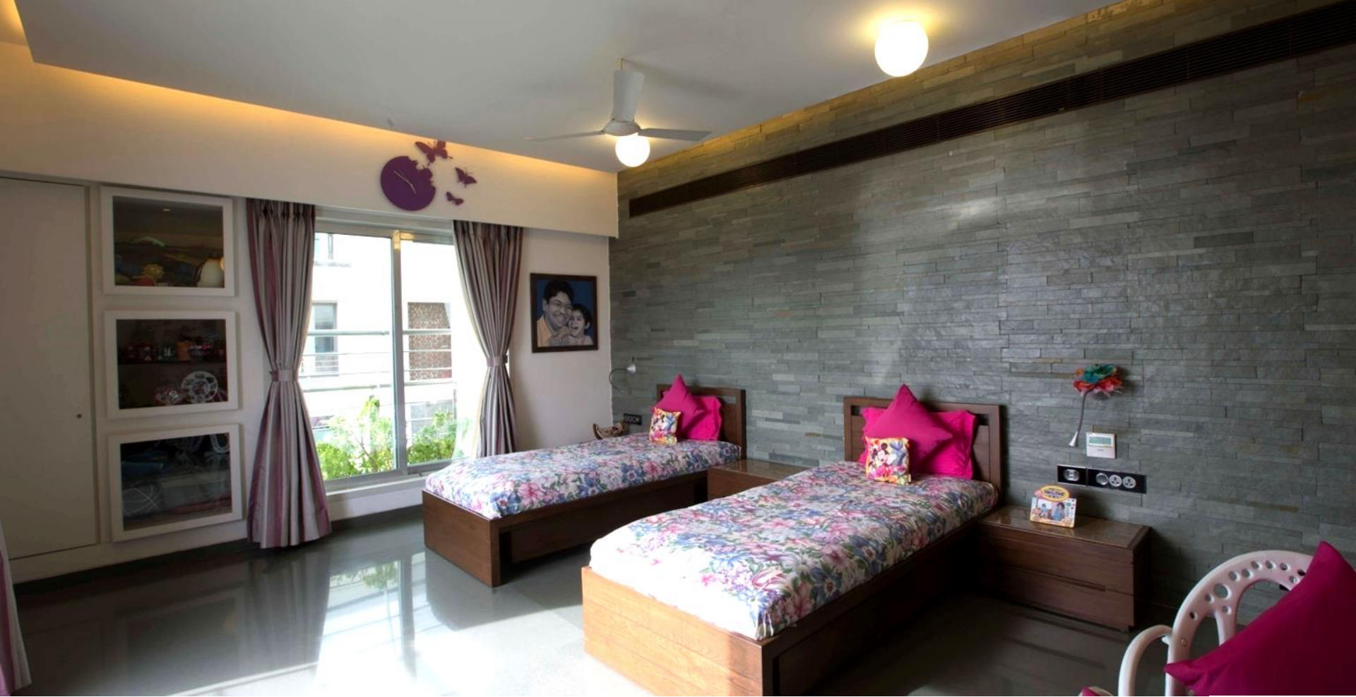
09. DAUGHTER'S BEDROOM