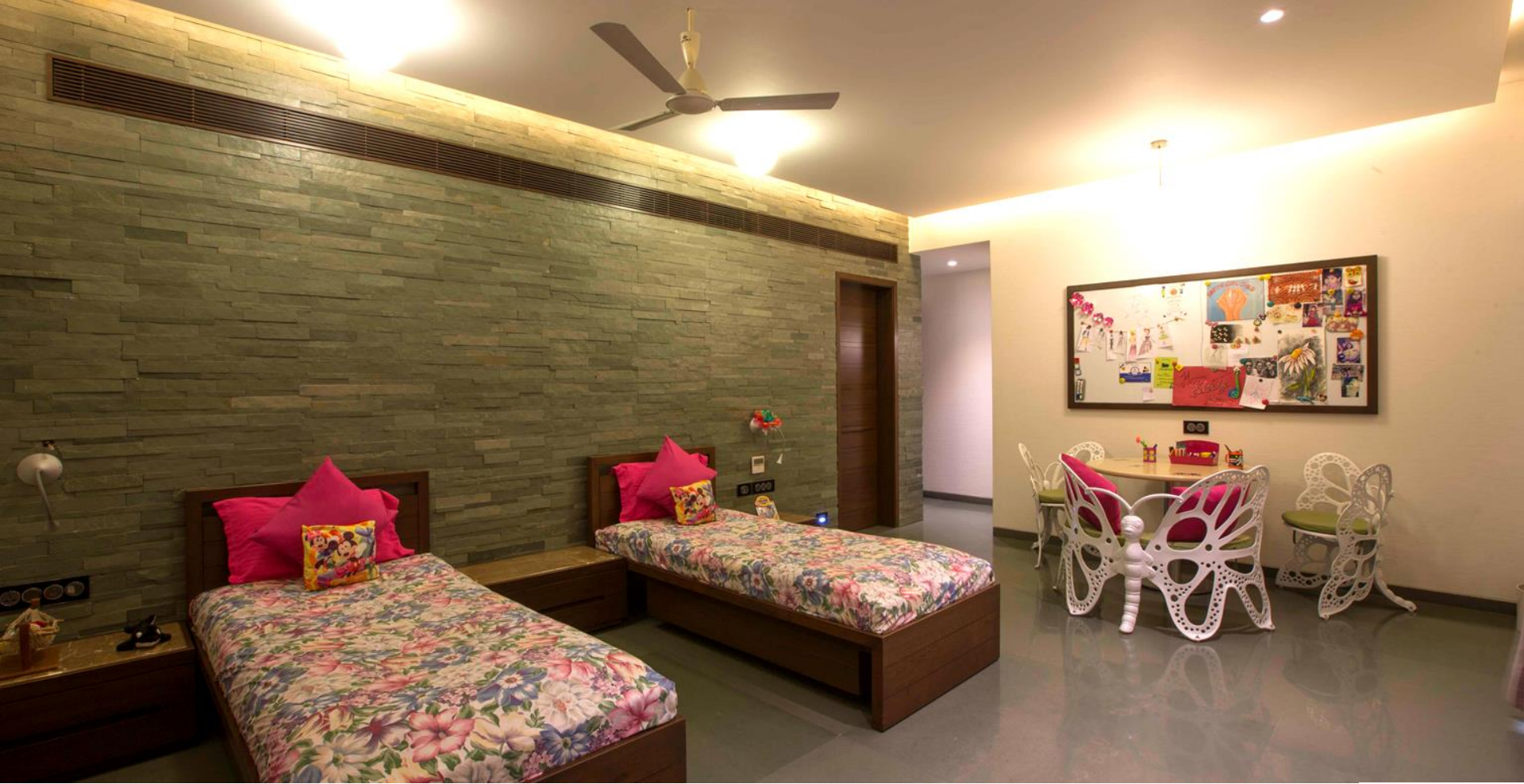
09. DAUGHTER'S BEDROOM