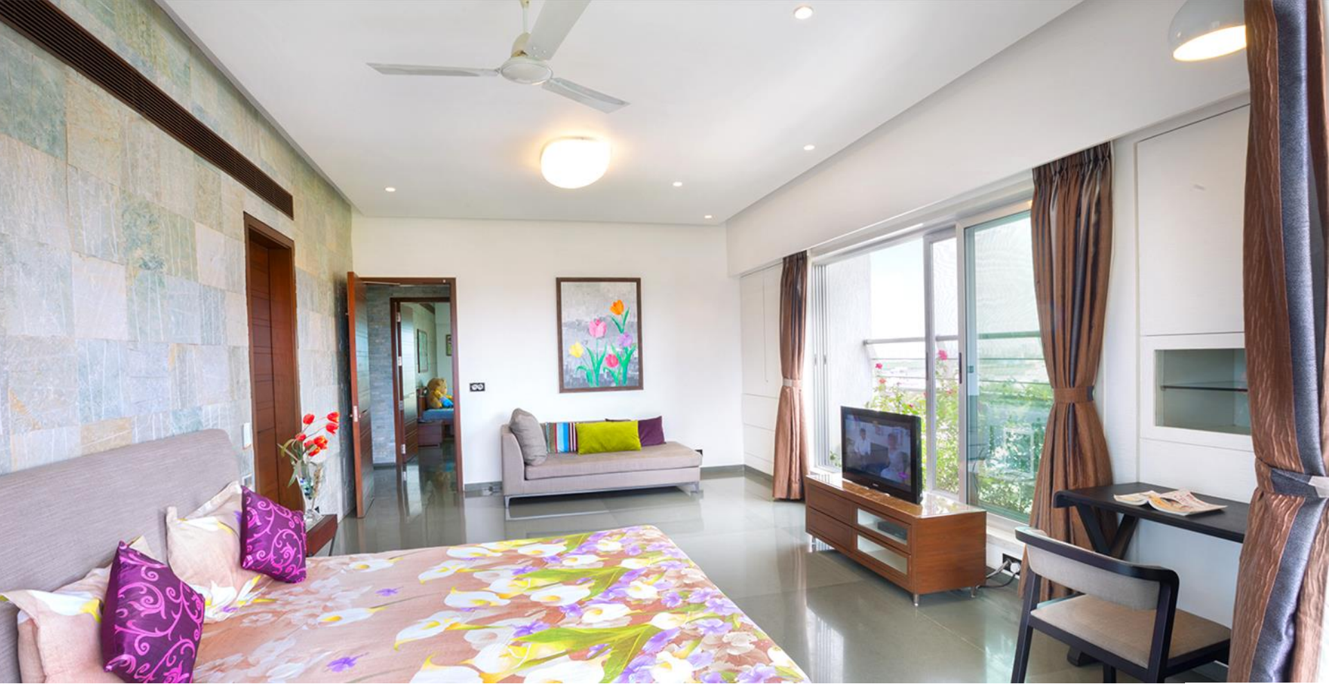
08. PARENTS BEDROOM