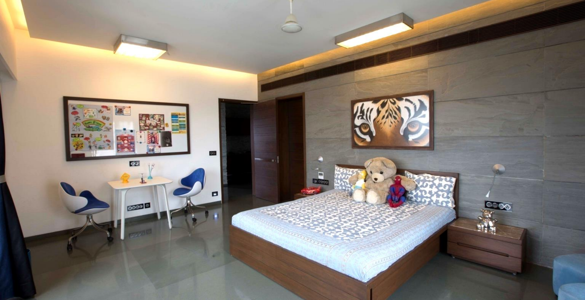
10. SON'S BEDROOM