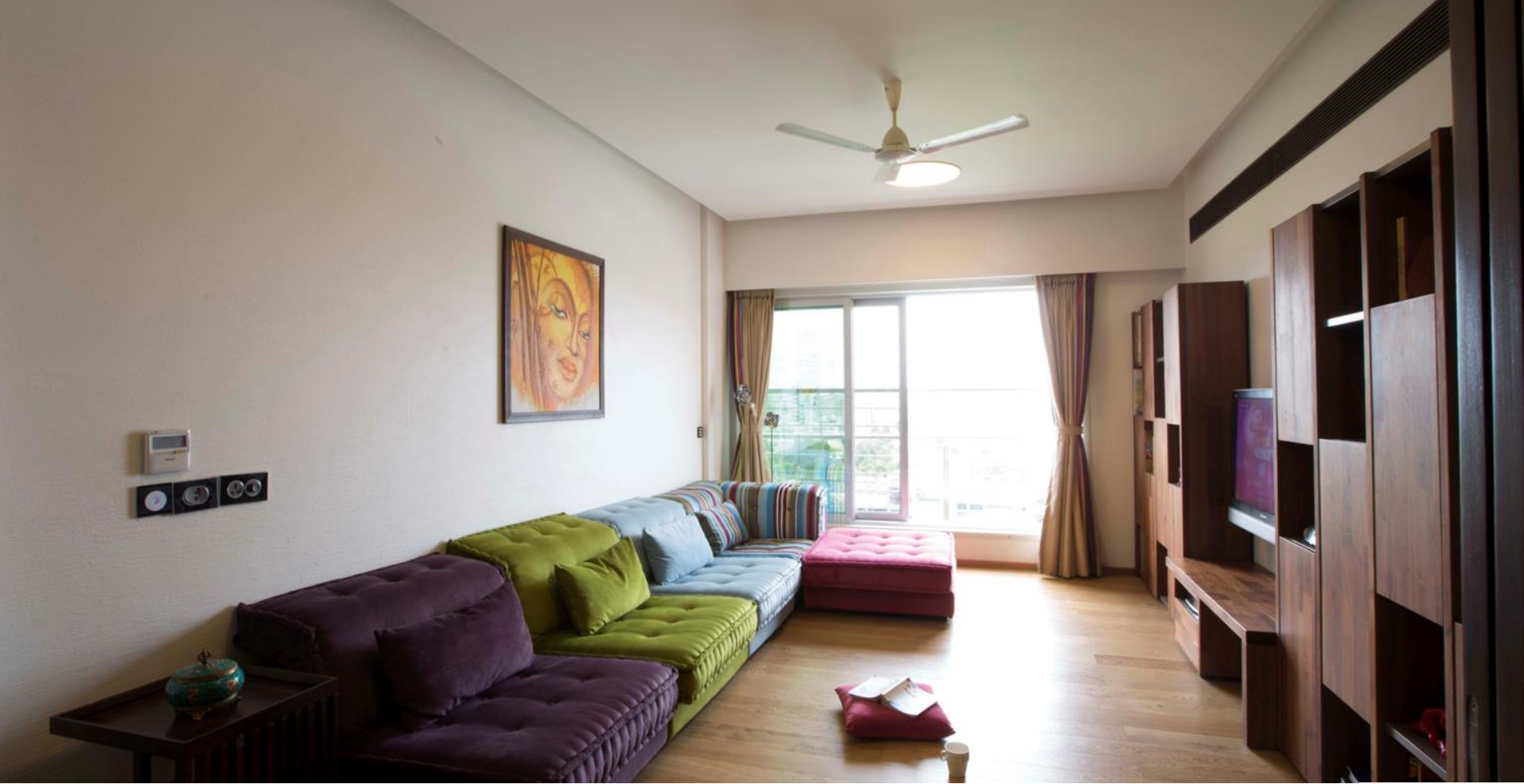
05. MULTIPURPOSE ROOM